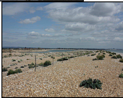
Shingle bank with sea to right and harbour on left. The ridges are formed by storm actions.