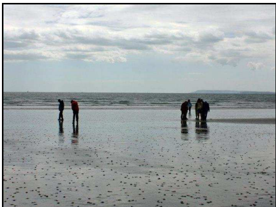
FGS members fossil hunting.