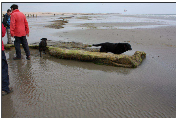
The 4,000 year old tree trunk, above, marks the east bank of a Holocene river. Animal bones are also found.