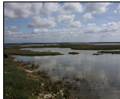
View of lagoon from East side of Pagham harbour.