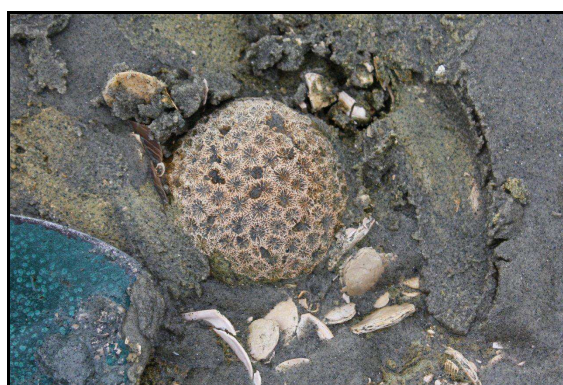
Turritella & Nummulites laevigatus (left) & Cardita (centre) at Wittering and Colonial coral, Goniopora (above) on flint.